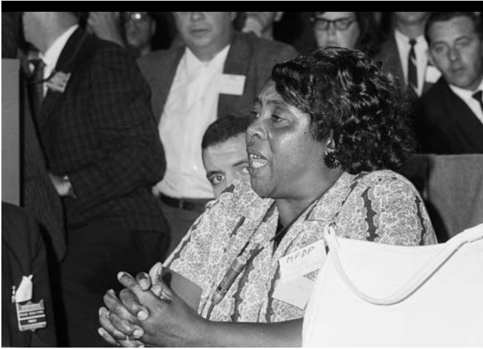
Fannie Lou Hamer speaking at a Credential Committee meeting during the DNC in 1964. She and other members of the MFDP were elected by voters newly registered during the Mississippi Freedom Summer. The MFDP was denied seats at the DNC.

Due to the severity of segregation in Mississippi, black residents could not register to vote through normal channels. In their efforts to increase black voter registration, local and national civil rights leaders formed the Mississippi Freedom Democratic Party as an alternative to the official, but all-white Mississippi Democratic Party. The MFDP adhered to all the rules and guidelines of the Democratic Party in the hopes that they would be officially accepted at the Democratic National Convention (DNC).