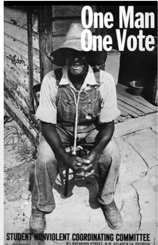
SNCC Poster used in campaign to register blacks to vote during Freedom Summer in Mississippi.

Preparation for real democracy calls for additional programs in the state. Literacy projects have been instituted, and food and clothing drives. But much more comprehensive programs are needed to combat the terrible cultural and economic deprivation of Negro communities in Mississippi.